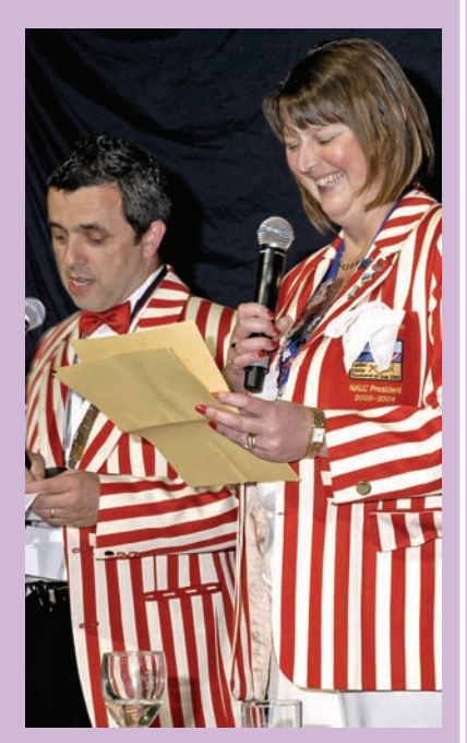
Two International Presidents.

Thursday night - International "Late" Lunch.