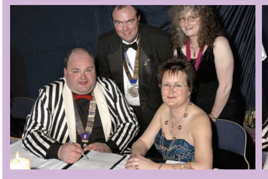
At the start of Friday evening the Round table and Ladies Circle signed the contract for the move of NALC into Marchesi House.